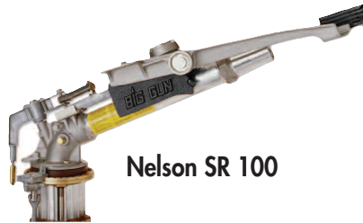
Nelson SR 100