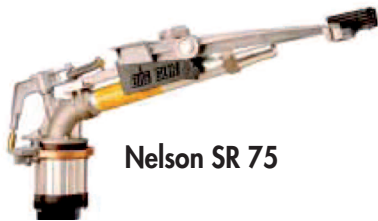
Nelson SR 75