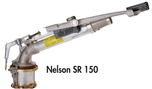
Nelson SR 150