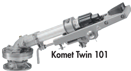
Komet Twin 101