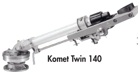
Komet Twin 140