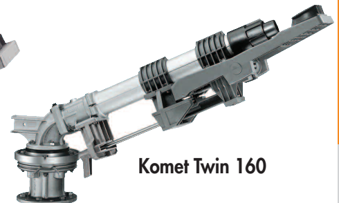
Komet Twin 160